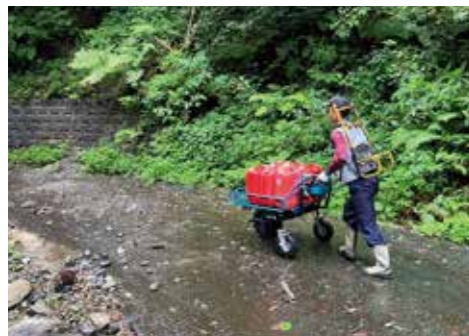
Electric wagon used at a forestry work site where roads have collapsed and vehicles were unable to pass through