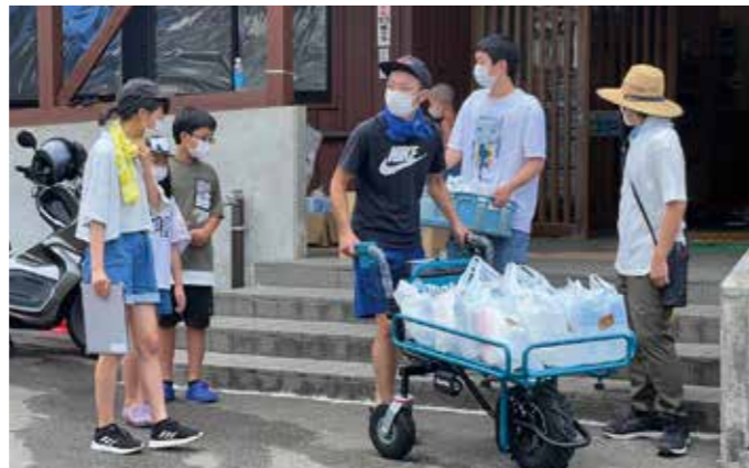
Transporting heavy water bags with local children

In addition, Civic Force loaned two electric wagons to the Tsukisara Partners Center, a nonprofit that promotes community development in Murakami City and other areas. In the affected communities, many hills and narrow roads made it difficult to transport relief items by car or truck, so the electric wagons were helpful to transport relief items to the homes of the elderly and other locations. The local children visited the affected communities together and interviewed the victims about their needs. Our partner thanked us saying, "Thanks to the electric wagon, we were able to smoothly deliver heavy water bags and other supplies."