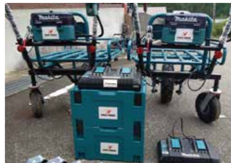
Electric wagons loaned by Civic Force