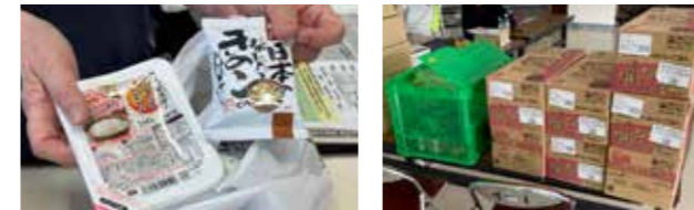
Rice and miso soup delivered to disaster-hit areas