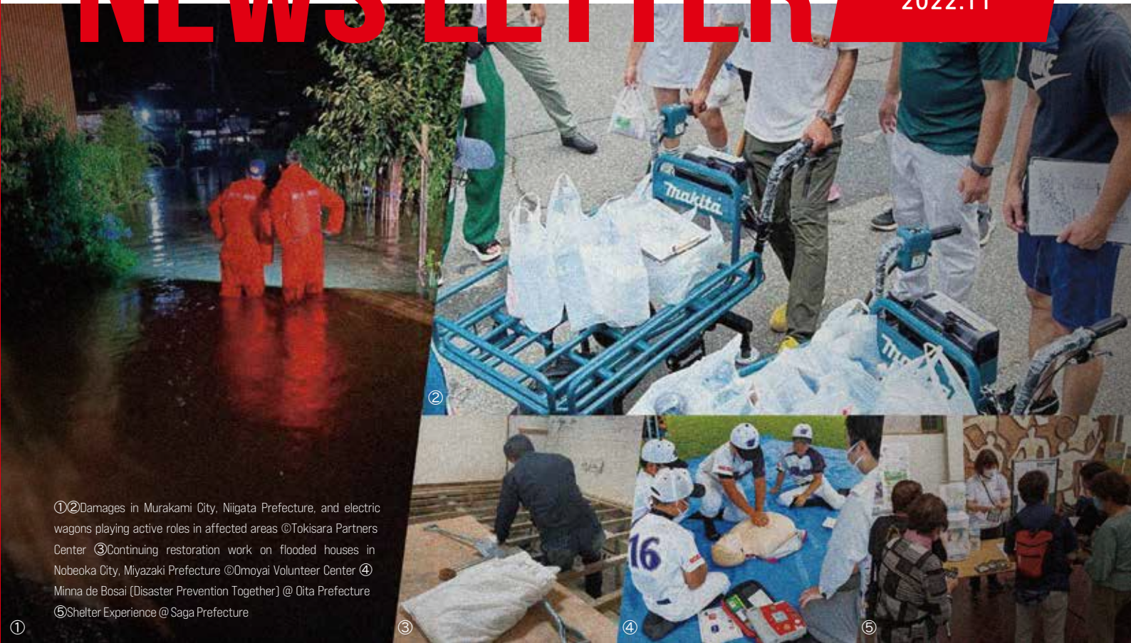
①② Damages in Murakami City, Niigata Prefecture, and electric wagons playing active roles in affected areas ③ Tokisara Partners Center ④ Continuing restoration work on flooded houses in Nobeoka City, Miyazaki Prefecture ⑤ Omoyai Volunteer Center ④ Minna de Bosai (Disaster Prevention Together) @ Oita Prefecture ⑤ Shelter Experience @ Saga Prefecture