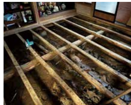
Less visible under-floor damage