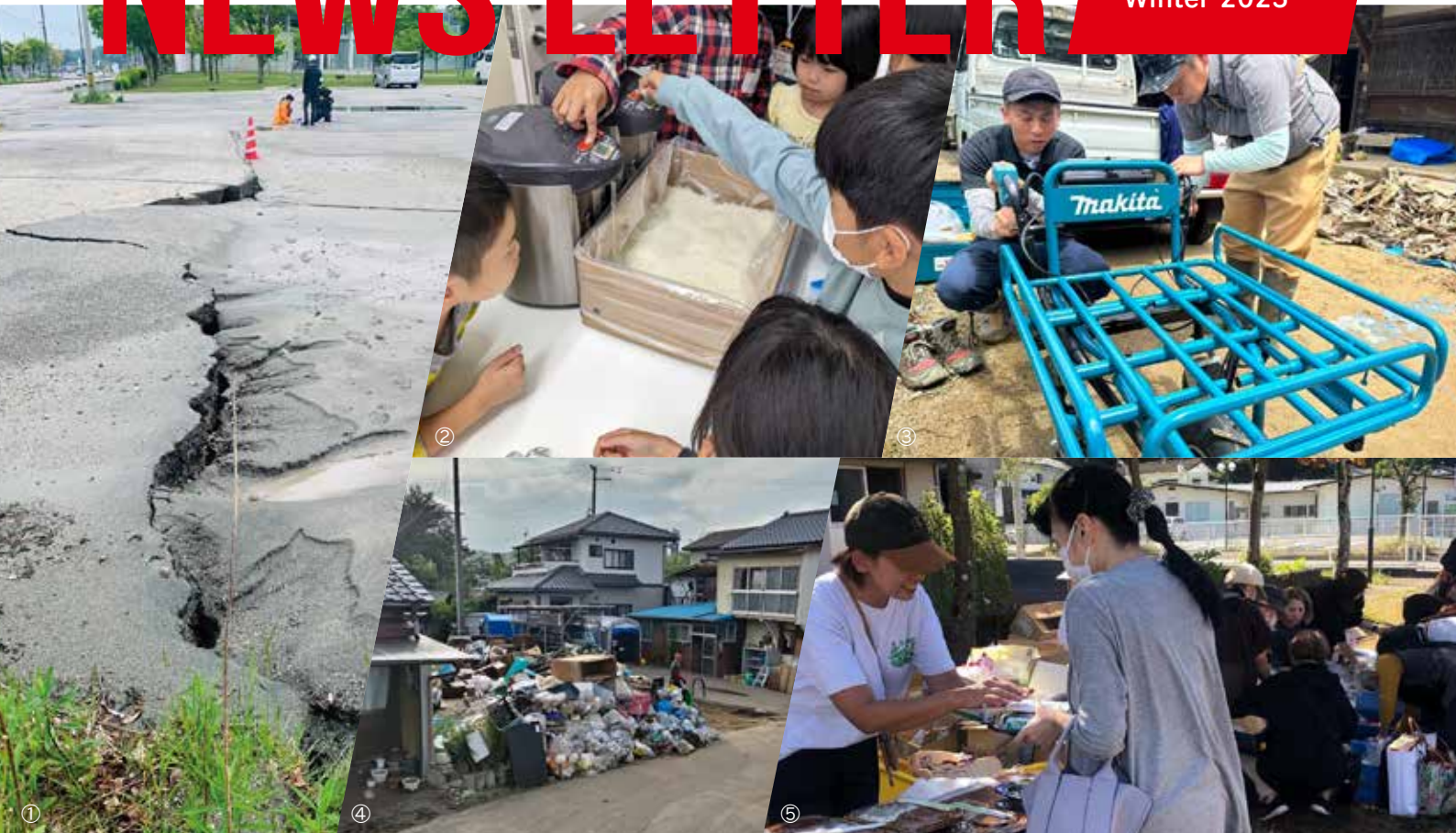
① Earthquake-affected area in Suzu City, Ishikawa Pref. ② Wakuwaku Disaster Prevention Workshop was held in Saga Pref. ③ Electric trucks played an active role in heavy rain-affected areas. ④ Cleaning up of houses is underway in Iwaki City, Fukushima Pref. ⑤ A relief supplies distribution event in Iwaki City.