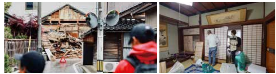
Civic Force has visited 20 affected houses so far. Many people have yet to rebuild their houses due to financial reasons or have been hesitant to ask for help from busy carpenters and contractors.