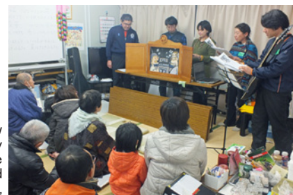
The picture-story show was performed by volunteers. They have been providing aid activities in Oshima.

The car ferry, "Dream-Noumi" was lent by Etajima City, Hiroshima Prefecture for free and it was in operation from April 2011 to February 2012 between Kesennuma City and Oshima, which was cut off from the mainland after the earthquake. Civic Force partly covered the costs of ferrying from Hiroshima Prefecture and fuel expenses through your donations and these activities were introduced in the show.