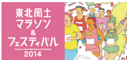
Tohoku Food Marathon & Festival 2014

The "Tohoku Food Marathon and Festival", an event for enjoying Tohoku food and specialties, will be held on April 27, 2014 in Tome city, Miyagi Prefecture. This event is a charity marathon supporting the disaster-hit Tohoku area. Civic Force was selected as one of the charitable NPOs of the event.