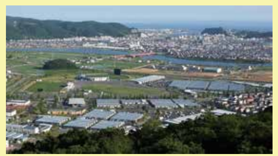
Because of the frequent occurrence of disasters, improving evacuation life is vital and requires evaluating policies to sufficiently take into account evacuees' needs. Photograph: Kaisei and Minamizakai districts, the greatest cluster of temporary housings in Ishinomaki City. (2019)

Since the Great East Japan Earthquake, Ishinomaki City in Miyagi Prefecture set up 7,000 temporary houses in 134 housing complexes, the largest number in the disaster-affected areas, and by January 2020, all the residents have left. To do a follow-up evaluation about materials, structure and location of the housings, as well as the effect on communities, Ishinomaki Jichiren (formerly Ishinomaki Temporary Housing Self-government Promotion Association) is conducting a survey to former residents and their supporters. The results of the survey will be utilized to reveal challenges regarding temporary housing for future disaster preparedness.